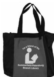
Tote Bag $10