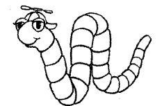
It's banana worm bread for me!