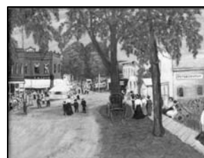
Petersburg Centennial book $15