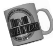
"Friends" Coffee mug $8

Flash drives & recordable CD's are also available!