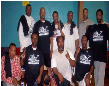
Grown Folks Champions - Old School

This year's league featured twelve teams from Monroe and Toledo. The teams competed in a ten weeks season with the top four teams from the East and West Division going into the playoffs. After crowning the Eastern and Western Conference Championship our overall Champions were crowned.